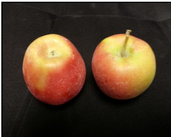
Apples from the treated orchard