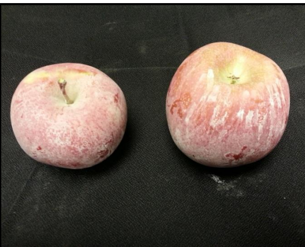
Apples from neighboring orchard