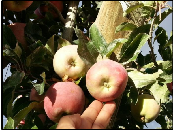
Apples from the treated orchard (with HydroFLOW )