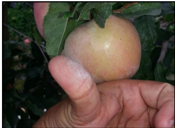
With HydroFLOW - Soft scale accumulation which easily rubs off