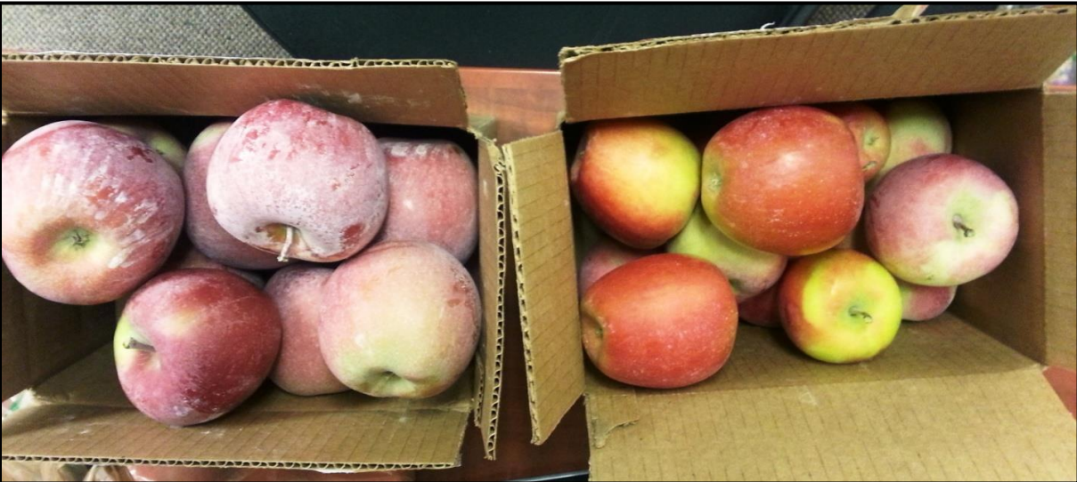
Apples from neighboring orchard