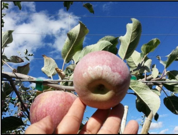
Apples from neighboring orchard (without HydroFLOW )