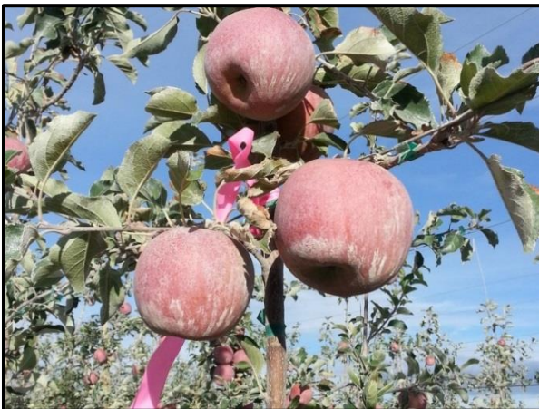
Without HydroFLOW - Hard scale accumulation which does not rub off

Scale deposits accumulate as fine powder which is very easy to remove. Over 90% of the apples are expected to receive the highest grade rating once processed. Note: The apples were picked at the end of 2013, placed in cold storage and are expected to be processed, packed and shipped during the first quarter of 2014.