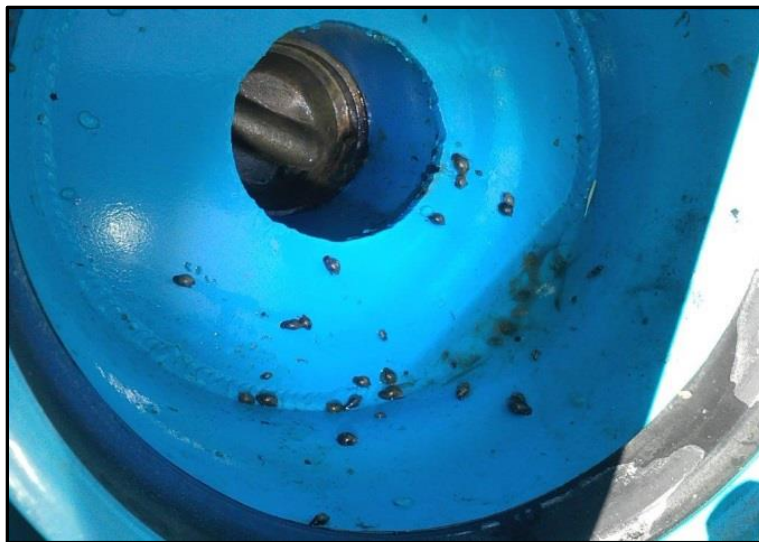
Snails in the filter before HydroFLOW