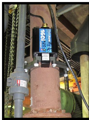
Figure 1: Installed HydroFLOW unit (Model 160i) at a wastewater treatment plant

The HydroFLOW I Range is powered by the patented Hydropath technology. When properly installed on a pipe (see Figure 1), it induces a 150 kilohertz, oscillating sine wave, alternating current (AC) signal. The electric induction is performed by a special transducer connected to a ring of ferrites. The pipe and the flowing fluid act as a conduit, which allows the signal to propagate. The induced AC signal is believed to cause the mineral ions that make up struvite (magnesium, ammonium, and phosphate) to form loosely held together clusters. When certain conditions are created (e.g., pressure change, temperature change, and turbulence) the clusters precipitate out of solution and form stable crystals of struvite that remain in suspension. The crystals are not able to adhere to surfaces as hard scale and are carried away with the flow. Because hard scale no longer accumulates, the shear forces created by the flowing liquid erode and soften existing scale deposits over time. It is important to note that constant liquid flow is required to remove hard scale deposits from a system.