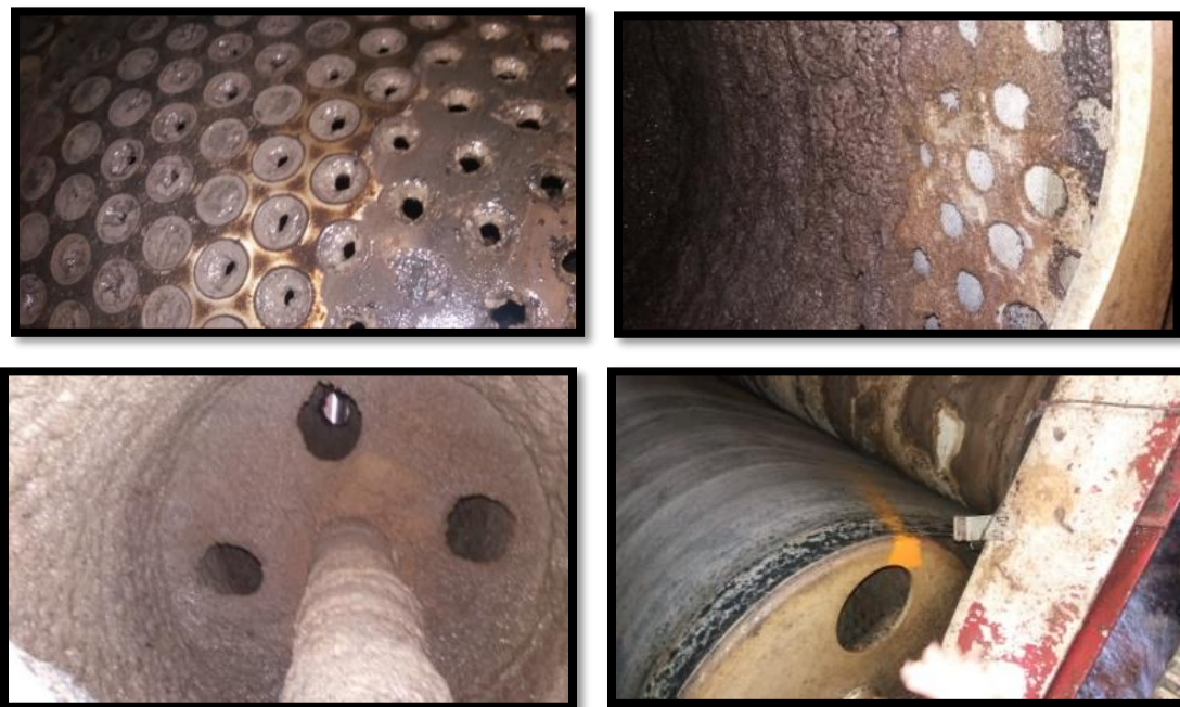
Figure 4: Baseline condition on 7 th September 2017 before HydroFLOW was activated

Before energizing the HydroFLOW unit, several pictures were taken to establish baseline condition. As shown in the Figure 4 below, heavy struvite encrustation was evident on the drum surface. Other parts of the BFP also showed struvite scale accumulation.