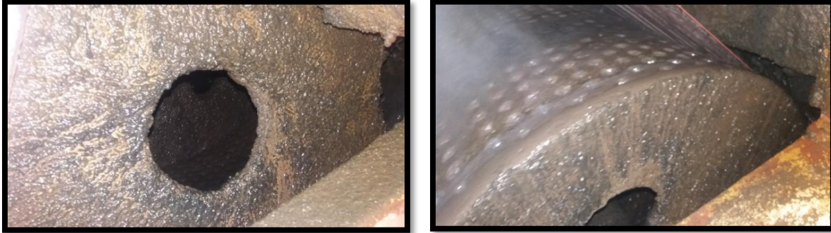
Figure 5: Final condition on 1st March 2018

Several pictures, taken on 1 st March 2018, were made available for review. These pictures (Figure 5), taken at the end of the 6-month test period, appeared to show softened and reduced scaling.