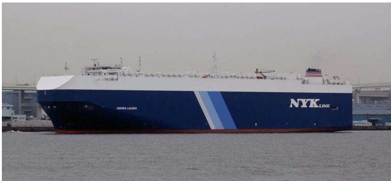
M/V Hermes Leader