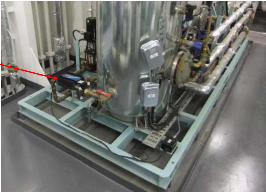
The two HM45 installed